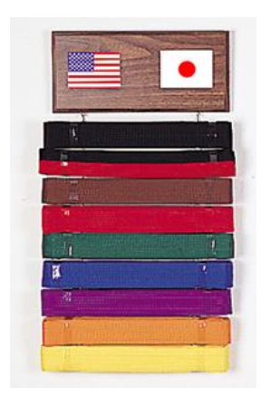
Belt Display Rack May look slightly different than pictured