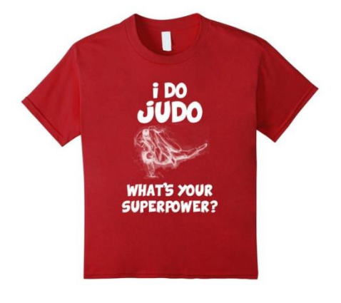
Judo Superpower T-Shirt