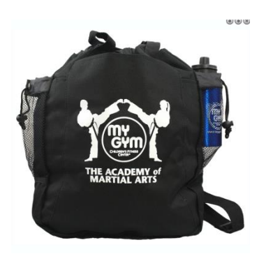
Convertible Martial Arts Backpack