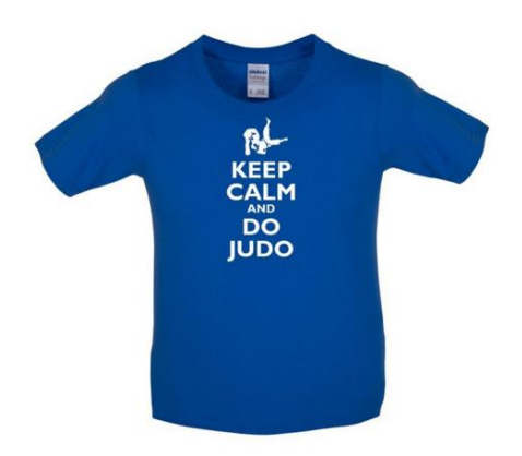
Keep Calm and Do Judo T-Shirt