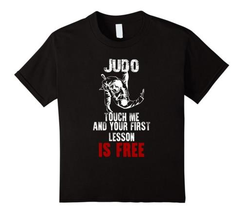
Touch Me and Your First Lesson is Free T-Shirt