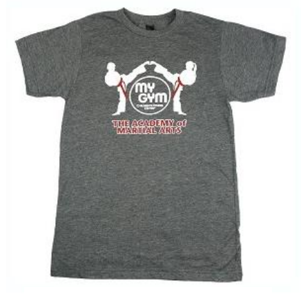
My Gym Martial Arts T-Shirt